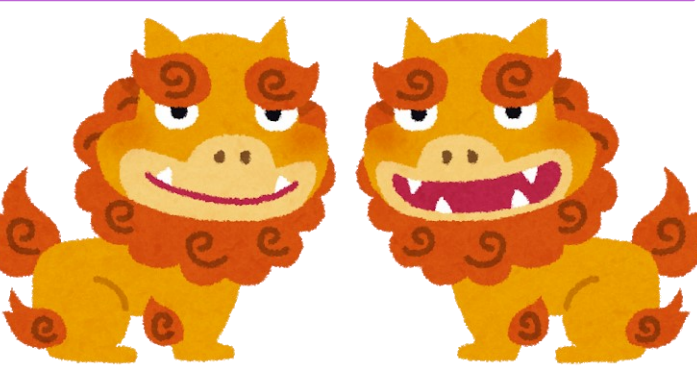
In Okinawa, a pair of Shisa will often be found guarding the entrance to buildings including homes. See if you can spot them if you visit!

In Okinawa, which was once the Ryukyu Kingdom, you can find the Ryukyuan languages which are related to but distinct from Japanese. In Okinawa 'hello' would be ハイサイ (haisai) for men or ハイタイ (haitai) for women.