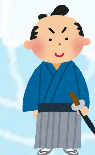
Ishikawa was home to the powerful Kaga clan, and even now you can visit historic sites to see how a samurai would have lived back then.

If you're in Ishikawa in the central Chubu region of Japan, you can try using あんやと (anyato 'thanks') when talking with friends. It can get shortened even further into just あんと (anto) !